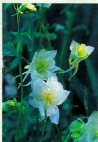
Clockwise from left, Lagerfeld with a camellia; an iris 'White City' and an aquilegia 'White Star' – 'I wanted to capture the essence of a baroque garden such as the one at Versailles'

W HEN IT was announced that Karl Lagerfeld, head of design at Chanel, had booked a corner site for a garden at the Chelsea Flower Show, you could have been forgiven for thinking that the wheel was being reinvented. The hype! The fuss! It took goodness knows how many pages of fashion magazines to launch it, as well as two dinners attended by glossy magazine editors, whose relationship with the oil is just about as distant as it can be.